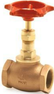
1029 Globe valve

Bronze globe valve BS 5154 PN32 Series B/NM, non metallic renewable disk