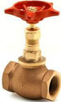
1031 Globe valve

Bronze globe valve BS 5154 PN32 Series B, metal disk