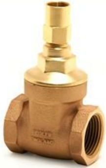
1070/125 LS Gate valve

Bronze full way gate valve with lockshield. BS 5154 PN20 Series B. BS21 Taper thread