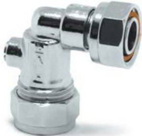
807 Ball valve

Chromium plated angle pattern brass service valve, copper x swivel union