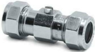
808 Ball valve

Chromium plated straight pattern brass service valve, copper x copper