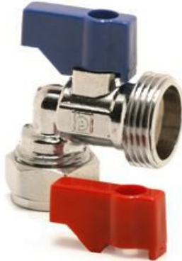
809B Ball valve

Chromium plated angle pattern brass washing machine tap, hot or cold, copper x male iron