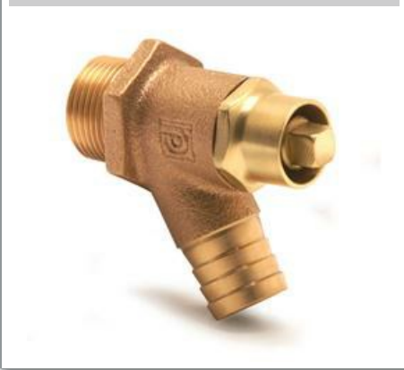
833 GMLS Draincock

Gunmetal lockshield draincock type A to BS 2879/2, male taper thread to BS 21