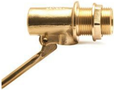
856-X Float valve

Float valve MOH, Portsmouth pattern, low pressure