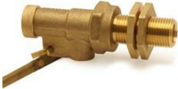
857N Float valve

Float valve Nylon seat, BS 1212-1 part 1, high pressure