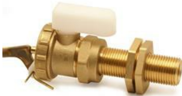
858N-Z Float valve

Float valve Nylon seat, BS 1212-2 part 2, high pressure