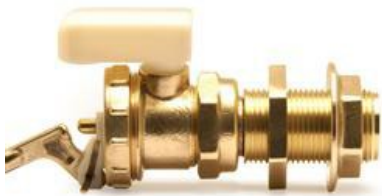
860N Float valve

Float valve Nylon seat, BS 1212-2 part 2, low pressure