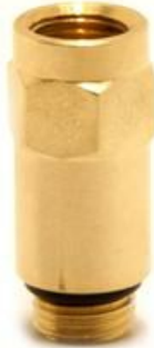
920EX Test point for Venturi

Venturi test point extension kit. Male taper thread