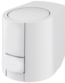
Thermic Actuator Modulating