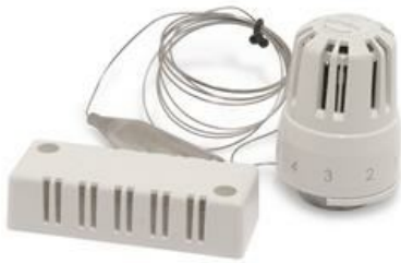
B1401 Liquid head with remote sensor