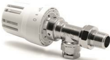
B4451/4 Angle horizontal anti theft