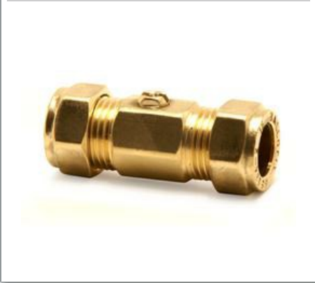
CxC Brass screw driver slot ball valve

Ballofix isolating ball valve - straight pattern. Compression ends. Screwdriver operation. DZR brass, plain finish