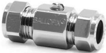
CxC Chrome screw driver slot ball valve

Ballofix isolating ball valve - straight pattern. Compression ends. DZR brass, commercial chrome finish