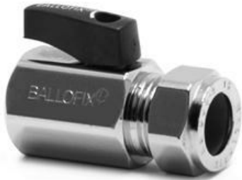
3331ZP Ball valve

Ballofix isolating ball valve - straight pattern. Compression x BSP parallel female thread. DZR, commercial chrome finish