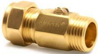
3375YA Ball valve

Ballofix isolating ball valve - straight pattern. Compression x BSP parallel male thread. DZR, plain finish