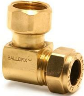
3160YA Ball valve

Ballofix service valve - angle swivel pattern. Compression x BSP union nut. Screwdriver operation