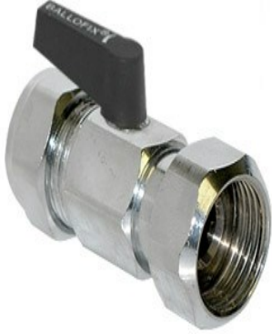
3140ZP Ball valve

Ballofix service valve - straight swivel pattern. Compression x BSP union nut. Plastic lever operation