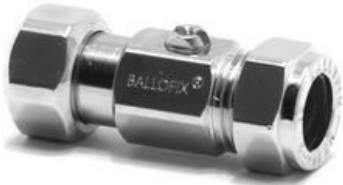
3140ZA Ball valve

Ballofix service valve - straight swivel pattern. Compression x BSP union nut. Screwdriver operation