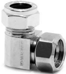
3160ZA Ball valve

Ballofix service valve - angle swivel pattern. Compression x BSP union nut. Screwdriver operation