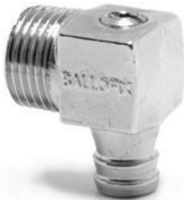
Draincock ball valve

Ballofix draincock. Screwdriver operation