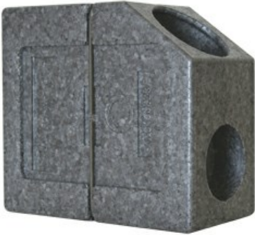
Insulation jacket for circulating valves