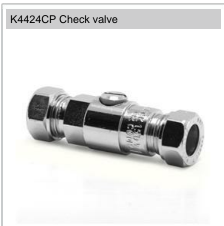
K4424CP Check valve

DZR chrome plated double check valve. Compression ends, copper x copper, BS EN 13959 E D