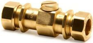
K4424 Check valve

DZR double check valve, compression ends, copper x copper, BS EN 13959 E D