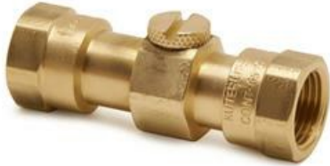
K4426 Check valve

DZR Double check valve. ISO 228 parallel female ends. BS EN 13959 E D