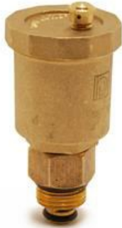
P775 Auto air vent

Brass automatic Air Vent. 10 bar at 110°C