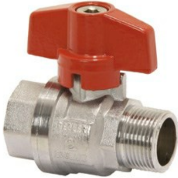
PB500MF T Ball valve

PB500MF T Chromium plated brass ball valve male x female tee handle