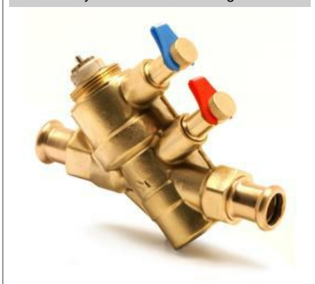
PS902S Dynamic commissioning valve

Venturi DZR Dynamic valve - excluding actuator. XPress ends for copper/carbon steel/stainless steel tube. Direct flow measuring