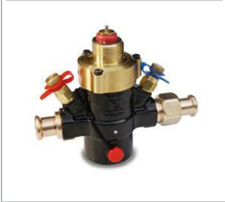
PSU1600 Pegler Proflow PICV (2x press with union connection)