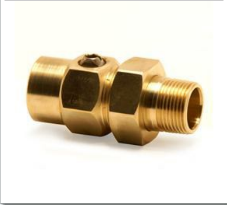
5060BA Ball valve

Ballofix radiator valve - straight pattern BSP parallel female thread x male iron union, screwdriver operation