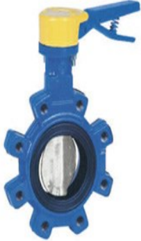
V907 Butterfly valve