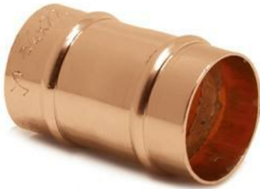
YP11M Slip Coupling

Adaptor coupling, imperial x metric copper x copper. To connect imperial tube to metric tube