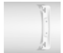
■ A reliable mounting bracket