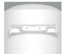
A universal mounting bracket