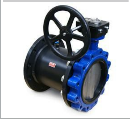
900XS Venturi commissioning valve

Venturi steel commissioning valve (FODRV), standard pattern