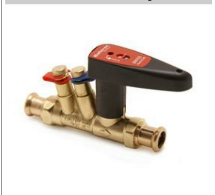
PS900S Venturi commissioning valve

Venturi DZR static commissioning valve (FODRV). XPress ends for copper/carbon steel/stainless steel tube