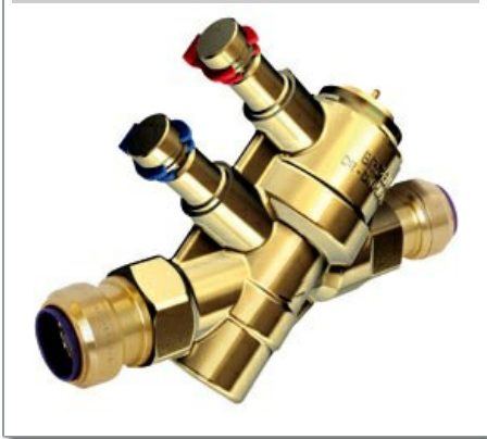
PT902S Dynamic commissioning valve

DZR Dynamic valve - no actuator. Tectite ends for copper/carbon steel/stainless steel tube