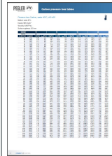
Pressure Loss Tables: Copper Water