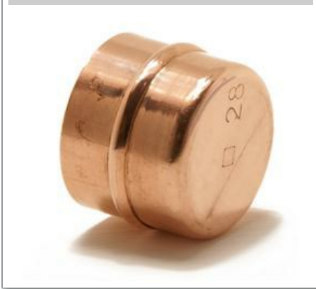
YP61 Stop End